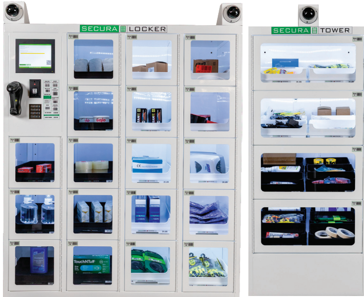
SecuraLocker with SecuraTower Add-On