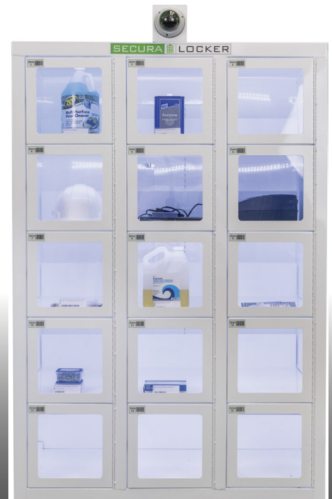
Tower and Locker Add-Ons Available