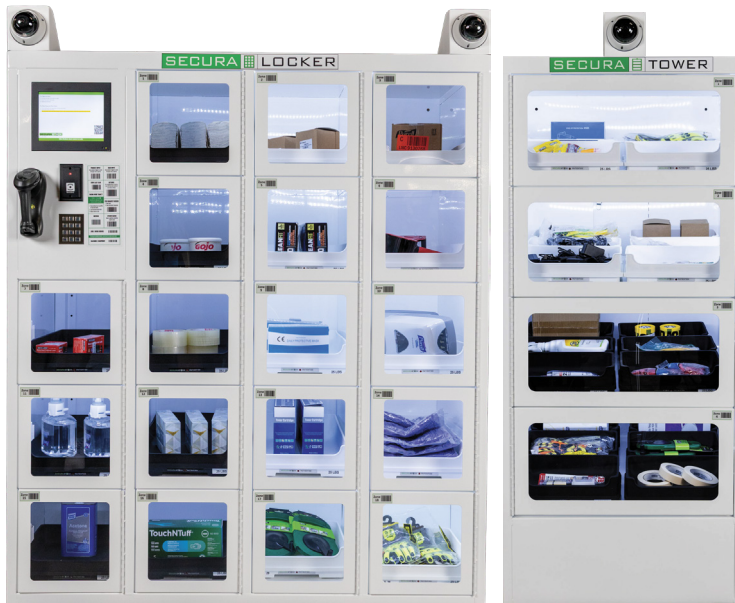
SecuraLocker with SecuraTower Add-On