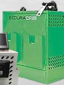
SecuraCrib & SecuraPort

High Tech Affordable & Portable Inventory Management