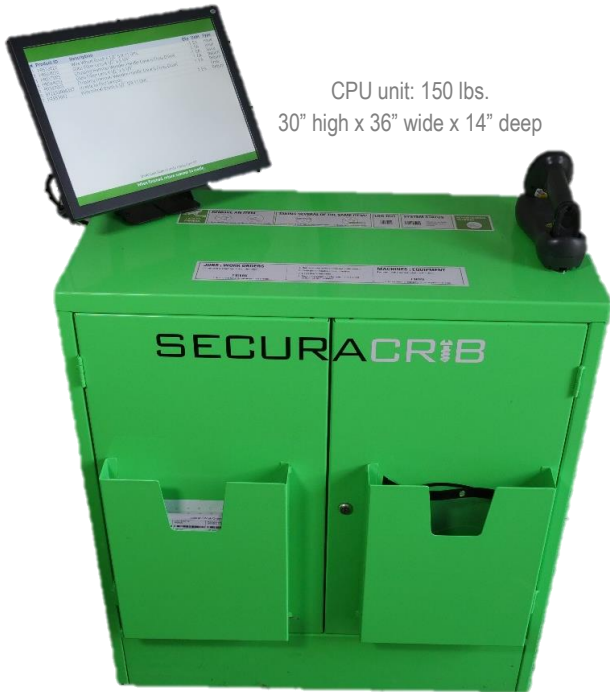
CPU unit: 150 lbs. 30" high x 36" wide x 14" deep