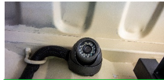
4 - 16 motion-sensing cameras