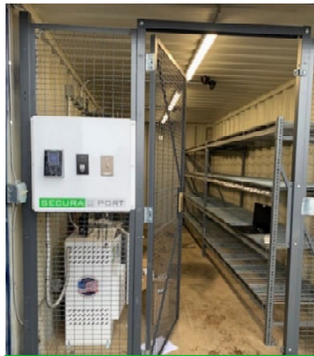
CPU unit: 150 lbs. 30" high x 36" wide x 14" deep